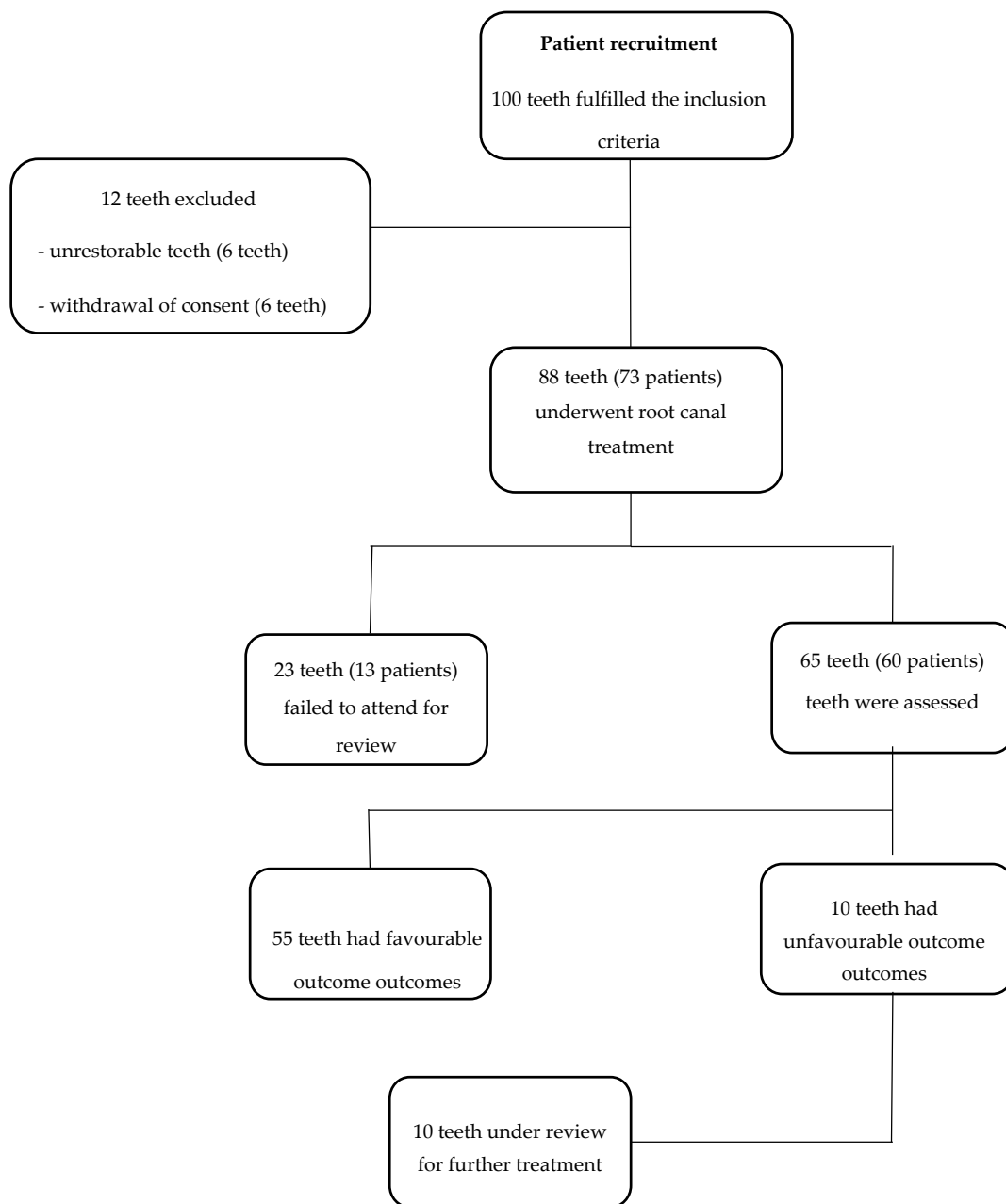
Figure 1. Flowchart of the trial showing the process of patient recruitment, exclusion and follow-up.

There were 10 teeth recorded as having an unfavourable outcome when assessed with CBCT (15.2%) and six teeth by PR (9.2%).