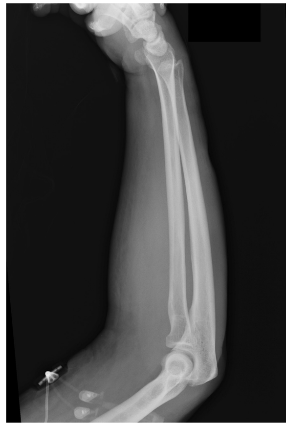
Figure 5 Lateral view of the right arm taken eight days after initial presentation demonstrating resolution of subcutaneous free air.

Subcutaneous emphysema has many causes ranging from the benign and non-infectious to severe necrotizing infections. In evaluating patients with subcutaneous emphysema a wide differential diagnosis is required to appropriately identify and treat the cause. Non-infectious causes of subcutaneous emphysema include trauma, perforation of the pulmonary or digestive system, blast injuries, air gun injuries, high pressure injection injuries, factitious injection of air, cutaneous ulcers, elbow arthroscopy, dental extraction, and iatrogenic use of hydrogen peroxide [1-5]. One case report highlights an episode of benign subcutaneous emphysema of the upper extremity without fractures or a pneumothorax, while another reports on self-induced lower extremity