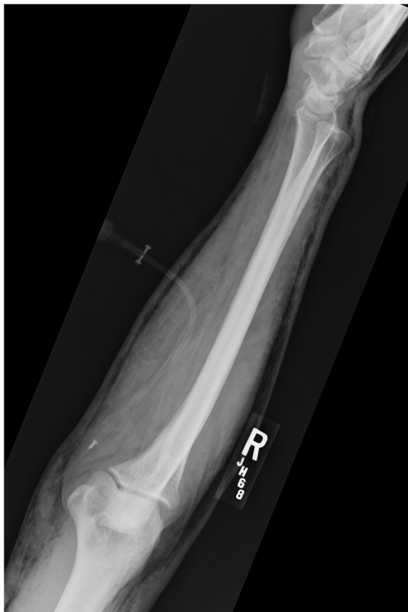
Figure 2 Lateral view of the right arm taken in the emergency department demonstrating significant subcutaneous free air.

upper extremities, chest, abdomen and scrotum. No air tracked along the deep fascial planes and there was no intramuscular air.