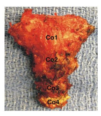
Fig. 1. Photograph of a resected coccyx specimen. This specimen from total coccygectomy shows widened Co-1 segment with its paired cornue.