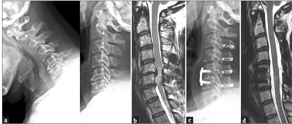
Figure 1: Radiographic studies of a 47-year-old man. (a) Dynamic plain radiograph of the cervical spine, lateral view, showing C5–C6 fixed local kyphosis. (b) Preoperative cervical spine magnetic resonance imaging T2 sagittal view showing C3–C7 stenosis and C5–C6 local kyphosis with major disc protrusion pathology. (c) Five-year postoperative cervical spine radiograph, lateral view, showing solid fusion of C5–C6 with good fixation of the miniplates of the laminae. (d) Five-year postoperative cervical spine magnetic resonance imaging T2 sagittal view showing an uncompressed, patent spinal cord