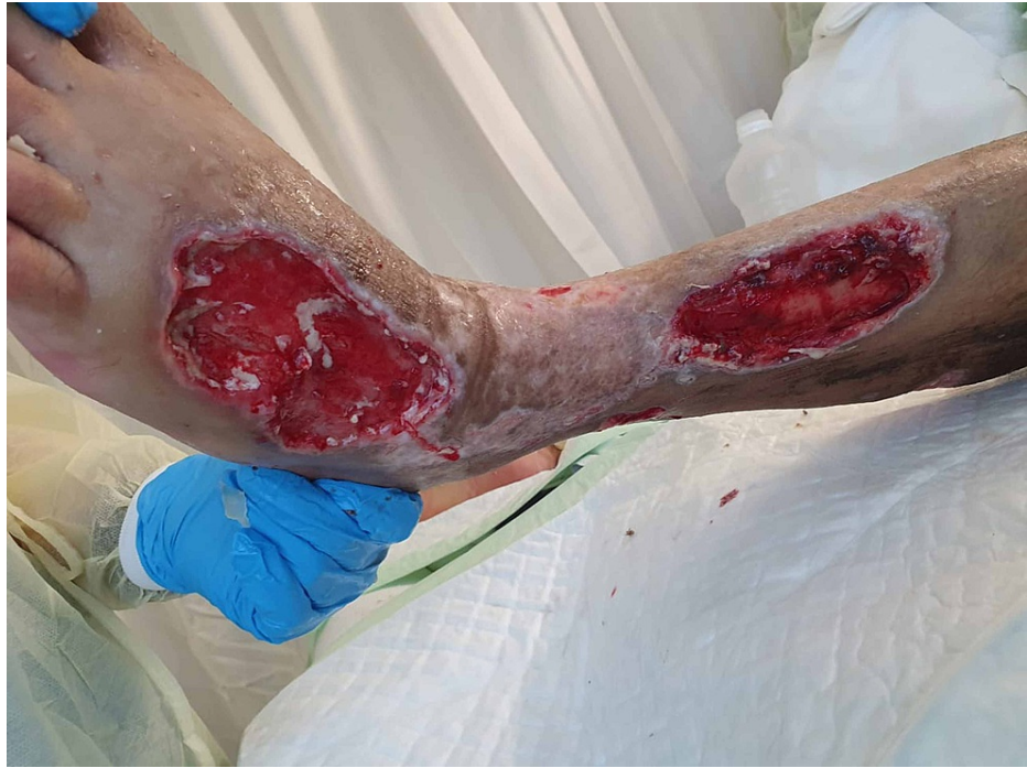
FIGURE 6: Lower limb soft tissue defects - image 2