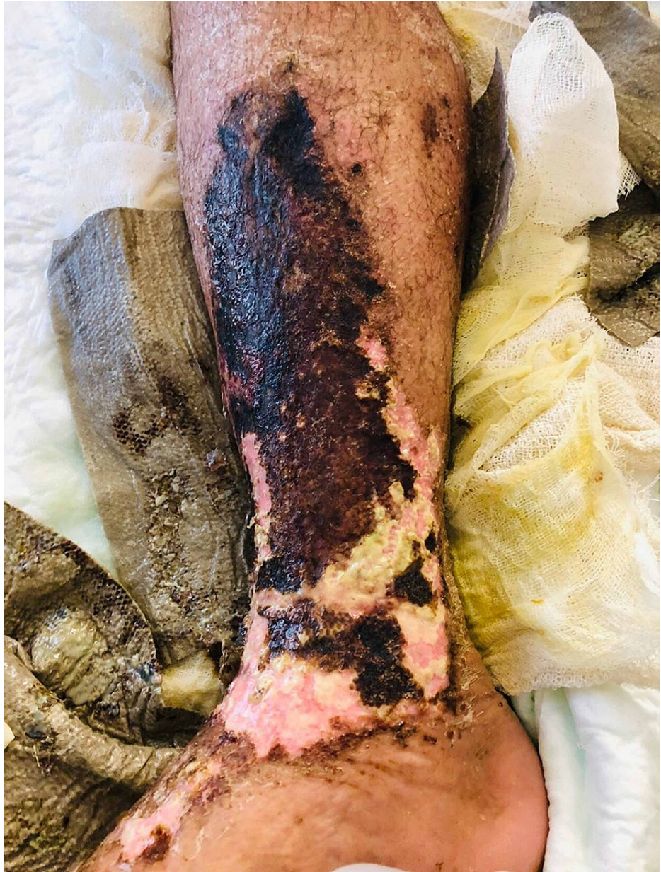
FIGURE 3: Patient's right lower limb one week after presentation