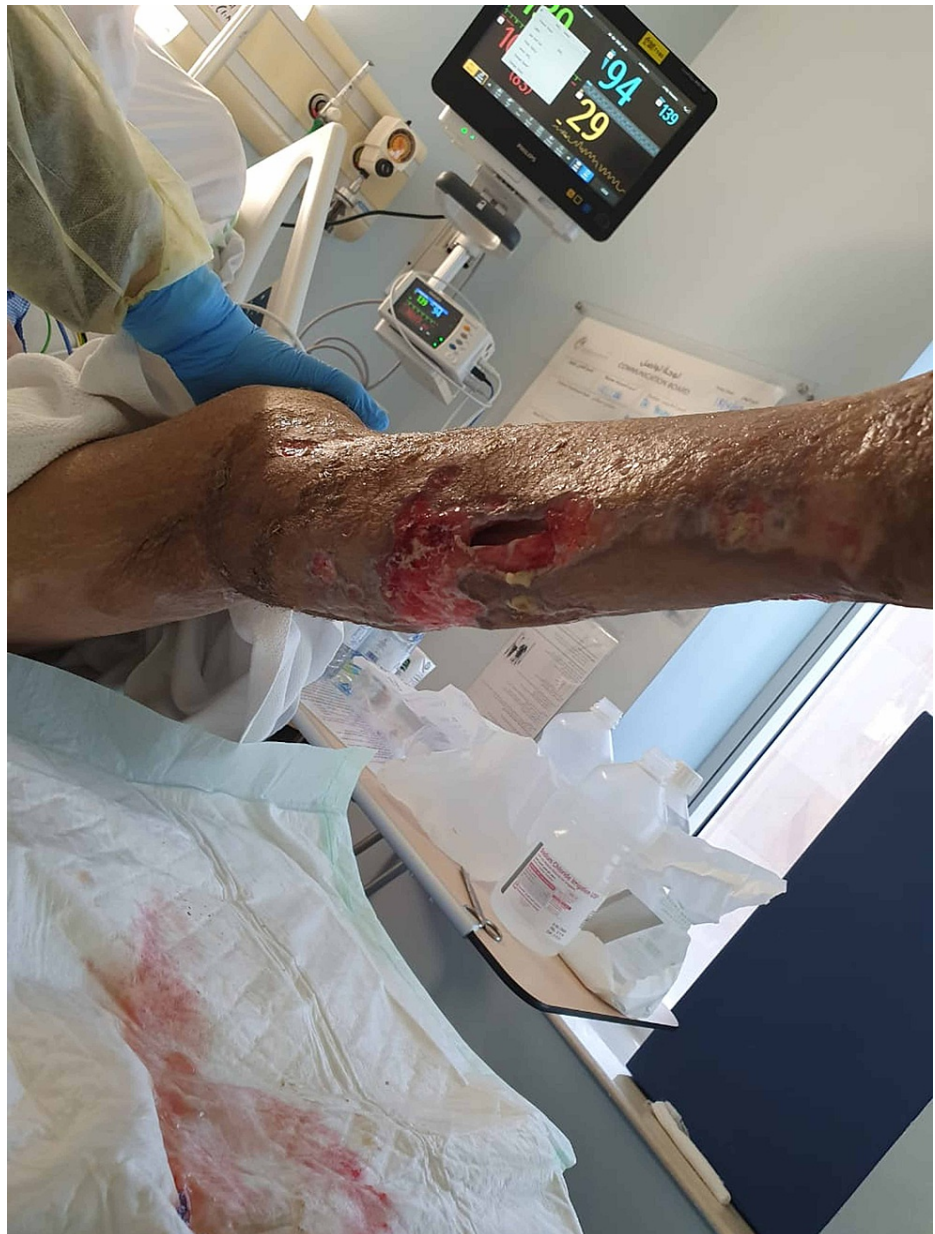
FIGURE 5: Lower limb soft tissue defects - image 1