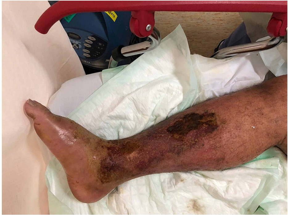
FIGURE 1: Patient's right lower limb upon presentation