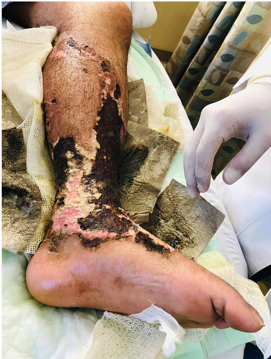
FIGURE 4: Patient's left lower limb one week after presentation

Two weeks later, the patient was extubated and his condition improved, and one month later, his labs improved and his pain subsided. Hence, the decision to discharge the patient was taken since all treatment options had been exhausted. By the time of his discharge, the patient had completely lost his lower limb sensation and function and had developed multiple soft tissue defects (Figures 5, 6). The plastic surgery department had decided that the soft tissue bed was contaminated and could not be rectified without formal debridement in the OR. However, the patient refused this option since he was informed that there was a possibility that he might lose his limbs based on the intraoperative decision. On the day of discharge, the patient developed shortness of breath and hypoxia; an urgent CT scan was carried out and he was found to have a massive pulmonary embolism, which eventually led to his death despite all resuscitative measures.