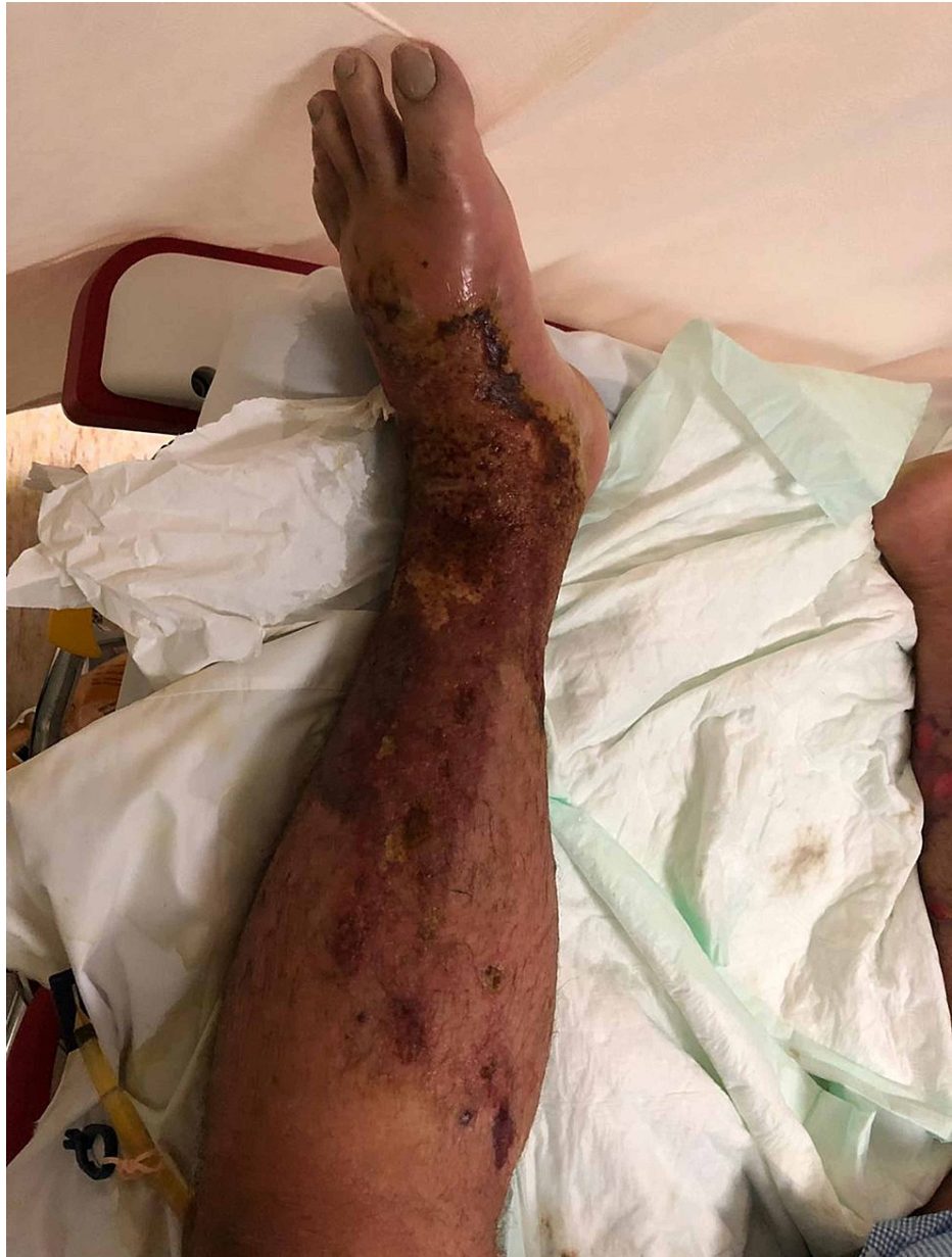
FIGURE 2: Patient's left lower limb upon presentation

The lower limbs were extremely tender to palpitation, and a range of motion test could not be attempted due to the severe pain. Bilaterally, his femoral pulses were palpable; however, his popliteal pulses were nonpalpable but audible by Doppler. Furthermore, his posterior tibialis and dorsalis pedis pulses were neither palpable nor audible by Doppler. CT angiogram of bilateral lower extremities showed patent arterial systems with no extravasation, diffuse skin thickening with subcutaneous edema, extensive areas of intramuscular collections, and fat stranding reaching the popliteal fossa. Blood and wound cultures were obtained along with a complete septic workup of the patient, which came back positive for Pseudomonas species. His labs in the emergency room are shown in Table 1.