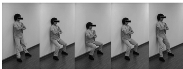
Fig. 1. Modified wall squat exercise

voluntary consent to participate in this study was obtained from all of the subjects. The mean \pm SD age, height, and weight of BEG were 20.8 \pm 0.3 years old, 161.8 \pm 6.6 cm, and 55.3 \pm 9.3 kg, respectively; and the mean \pm SD age, height, and weight of MWSEG were 20.7 \pm 0.3 years old, 162.9 \pm 4.5 cm, and 56.3 \pm 9.7 kg, respectively. Analysis of group difference in gender was made using the \chi^2 test, and analyses of group difference in age, height, and weight were made using the independent t-test. The above factors were not significantly different ( p>0.05 ), therefore the two groups were considered homogenous.