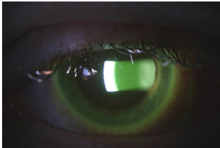
Figure 1: A typical slit-lamp picture after collagen cross-linking (CCL), indicating presence of riboflavin in the anterior chamber.