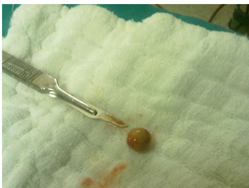
Figure 3. Extracted appendicolith.

The appendicolith is formed by firm, dense stool and mineral deposits. It is also known as appendiceal calculi, appendiceal enterolith or appendicular