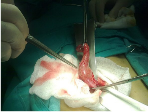
Figure 2. A huge appendicolith, located in the base of the appendix causing appendicitis.

layers were closed. The patient was treated postoperatively with intravenous Ceftriaxone 2 gr/day and Metronidazole 1 gr/day. Histopathological examination of the appendix revealed a gangrenous appendicitis (Fig. 5). There was no problem in the postoperative period. The patient was discharged on the 3rd postoperative day.