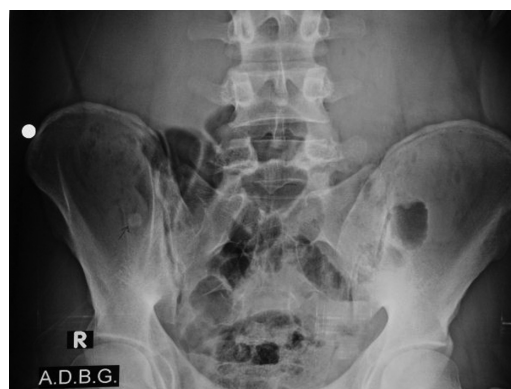
Figure 1. An opacity (appendicolith) in abdominal x-ray.

An eighteen year old male patient presented with one day of abdominal pain, nausea and vomiting. On physical examination, rebound tenderness and defence in right lower quadrant were detected. The leukocyte count was 15.400 \text{ cell/mm}^3 (Normal: 4.800\text{--}10.800 \text{ cell/mm}^3 ) and CRP was 17.5 \text{ mg/dL} (Normal: 0.0\text{--}1.0 \text{ mg/dL} ). The appendix was 9.8 mm in diameter in abdominal USG and there was an appendicolith within the appendix lumen. A gangrenous and perforated appendix was found in surgical exploration. There was purulent fluid in the right paracolic region. The appendectomy was performed. A drain was placed into the douglas pouch. The abdominal