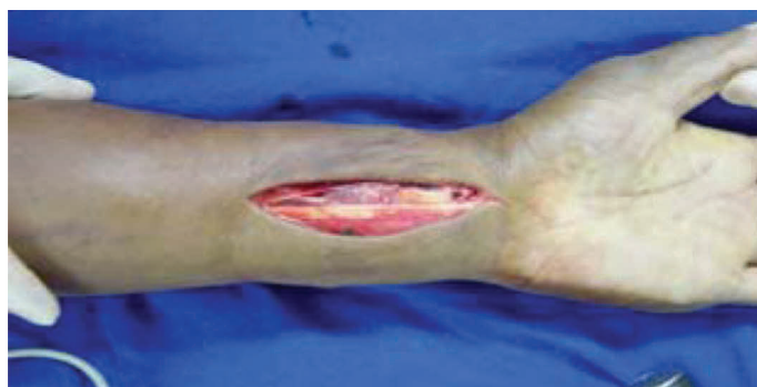
Figure 1 – Volar incision of Henry type for placement of volar plate.

Each patient was evaluated during the immediate postoperative period and three and six months after the surgery. The evaluation consisted of radiographic analysis, goniometry and a grip strength test (Jamar ® ).