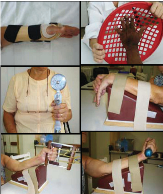
Figure 5 – Rehabilitation exercises started on the tenth day after the operation.

The statistical analyses were performed using repeated-measurement models with random between-individual factors relating to the four measurements on each patient, and a fixed factor between individuals relating to the treatment with volar or orthogonal plates. The dependence between the measurements made on the same patients was incorporated with unstructured matrices of covariance, with the exception of pronation measurements, for which a compound symmetry structure was used. Descriptive levels ( p ) less than or equal to 5% were taken to be significant differences.