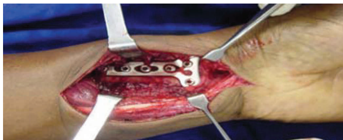
Figure 2 – Volar plate (Synthes 3.5 mm) in place.