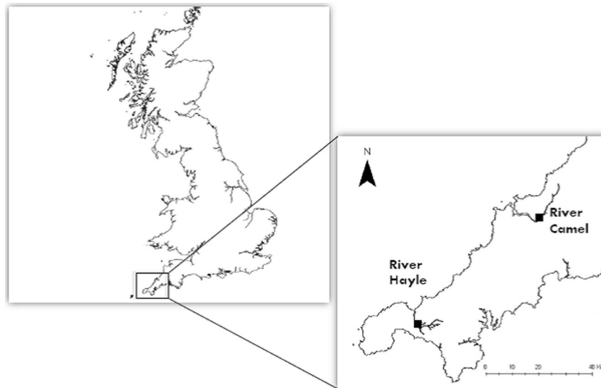
Figure 1. Map of River locations in Britain. Map of Britain, highlighting the rivers Hayle and Camel in southwest England. The River Hayle was used in this study as a region that has suffered from historical metal pollution. The River Camel was used as a relatively clean source in comparison. DNA from trout from both rivers was used to amplify the MetA and MetB genes.

genomics, largely because robust methods for identifying such interactions did not exist. However, in 2005, synthetic lethal interactions between mutations in the breast cancer susceptibility genes (BRCA1 or BRCA2) and members of the poly ADP ribose polymerase (PARP) enzyme superfamily were identified 20,21 . These studies demonstrate the validity of using synthetic lethality as a novel approach in identifying components of a genetic network. The utilization of SGA screens, using yeast as a bait to express an exogenous gene, highlights the robustness of this technique, and suggest its usage can be extended to other systems 22 . Although these experiments are performed in S. cerevisiae , SGA relies on the mating ability of this versatile yeast and such methods are therefore applicable to the analysis of interactions for metal tolerance in brown trout. Moreover, S. cerevisiae is known to be intrinsically sensitive to metal stress. This makes it an ideal model organism to test the effects of over-expressing genes that may be involved in metal tolerance.