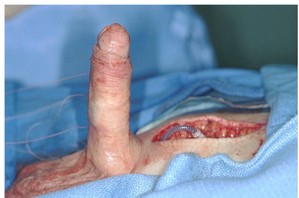
Figure 3 Penile straightening postdevice placement and modeling.

A more recent study from 2011 by Garaffa et al 32 describes successful straightening via modeling in 50 out of 62 patients (84%) with insertion of an IPP compared with seven out of 13 (54%) of those who received a malleable device. In this study, all patients' curvatures were assessed preoperatively via intracavernosal injection of prostaglandin E1. After insertion of the prostheses, residual curvature was assessed by inflating to ~80% of maximal capacity. Patients with a residual curvature greater than 10°–20° underwent penile modeling. Complications included infection of the inflatable prosthesis in three patients (2%), residual curvature in four (3%) patients, pump failure in four patients (3%), tubing rupture in two patients (1.5%), damage to the