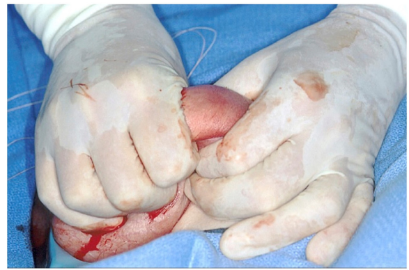
Figure 2 Intraoperative modeling postdevice placement.

28 of 30 patients who underwent the penile straightening and modeling procedure achieved complete straightening with modeling alone. Additional procedures including glanuloplasty were required in two patients, and plaque incision and graft placement was required in one patient. No patient had a postoperative infection, mechanical malfunction, or experienced urethral erosion at the 3–32-month follow-up period. 11