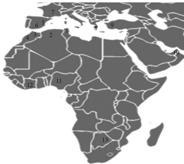
Figure 2 - Geographical location of population samples used for comparisons. 1: Tunisia (general population, Gabes sample, and El Hamma group); 2: Algeria; 3: North Morocco; 4: West Morocco; 5: Valencia (Spain); 6: Andalusia (Spain); 7: France; 8: Cyprus (Greek Cypriots); 9: Cyprus (Turk Cypriots); 10: United Arab Emirates; 11: Nigeria; 12: Ivory Coast; 13: Sotho.

We also used the exact test to compare our two samples with sub-Saharan populations on one hand, and North African populations (Algeria, North Morocco and West Morocco) on the other. For the El Hamma group, the exact test indicated a more marked differentiation from the North