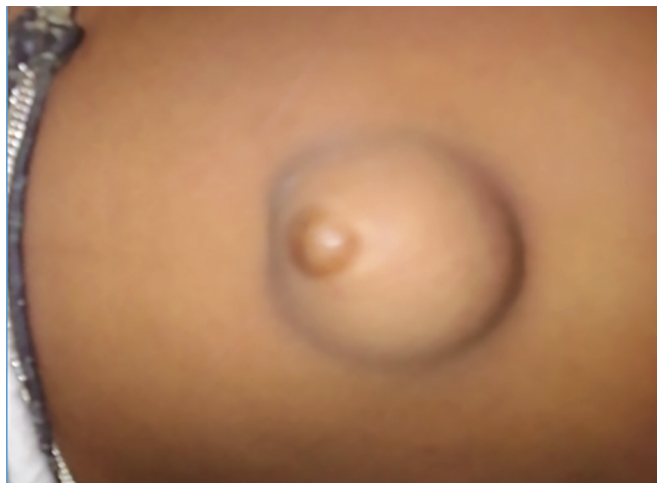
Fig. 1: Umbilical hernia