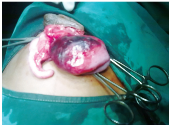
Fig. 2: Inflamed appendix and cecum