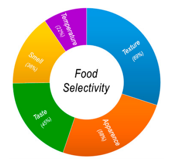
Figure 1. Factors that could determine food selectivity (data taken from the studies of Williams, Schreck and Klein [52–54]).

However, one of the major issues concerns the definition of selectivity, which complicates the evaluation and the comparison of the results of different studies. Atypical eating behaviors and the peculiar lifestyle of ASD (i.e., different levels of physical activity; idiosyncratic social skills; poor social interaction) are factors that imply risks of malnutrition, both in excess and in default [51]. Furthermore, studies have indicated that food selectivity is being determined by the following factors: texture (69%), appearance (58%), taste (45%), smell (36%), and temperature (22%), as well as reluctance to try new foods (69%) and a small repertoire of accepted foods (60%) (Figure 1) [52–55]. A strong preference for starches, snacks and processed foods, along with a rejection of fruits, vegetables or protein, is particularly common [56,57]. Increased consumption of snack foods and calorie-dense foods can lead to excessive weight gain, with related higher rates of obesity in ASD children than in unaffected children [58]. Indeed, obesity-related complications (e.g., hypertension, diabetes) are generally more prevalent among adults with ASD [59]. Nadon et al. found that nearly 90% of preschool and school age ASD children do not process sensory information, in particular related to touch, smell, sight, and hearing, in the same way as their typically developing peers [60]. Some studies reported that ASD children had strong food preferences [61].