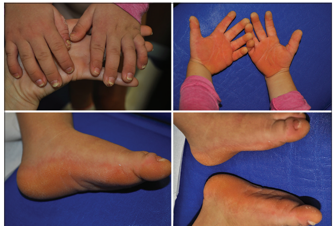
Figure 2: Nail dystrophies and palmo-plantar hyperkeratosis with desquamation