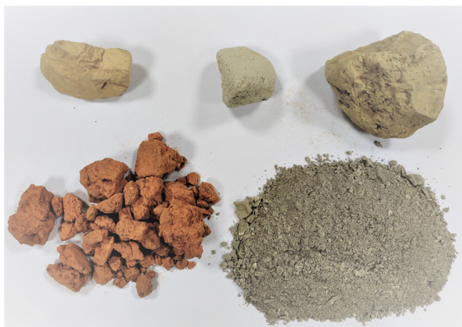
FIGURE 1 Photographs of geophagia tablets or samples from marketplaces in East and Southern Africa