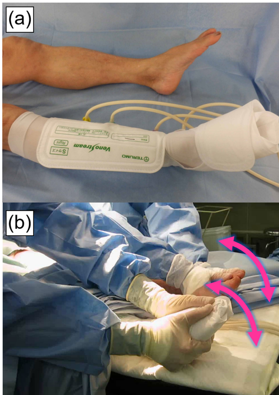
Fig. 2 Photographs of a gradual compression stocking (GCS) and intermittent pneumatic compression device (IPCD) (a) and intraoperative passive plantar flexion motion (b)

components were fixed with cement. GCS and IPCD (Veno Stream®R, Terumo, Tokyo, Japan) with a pressure of 60 mmHg were applied to the non-operated limb (Fig. 2a), and a drain was placed postoperatively. As an intraoperative mechanical prophylaxis, passive plantar flexion motion (Fig. 2b) was applied simultaneously to both sides of the ankle joint for up to 100 times in total at a rate of 3 times/sec. The procedure was continuously performed by two medical staff before the application of air tourniquet and during the first and second release of