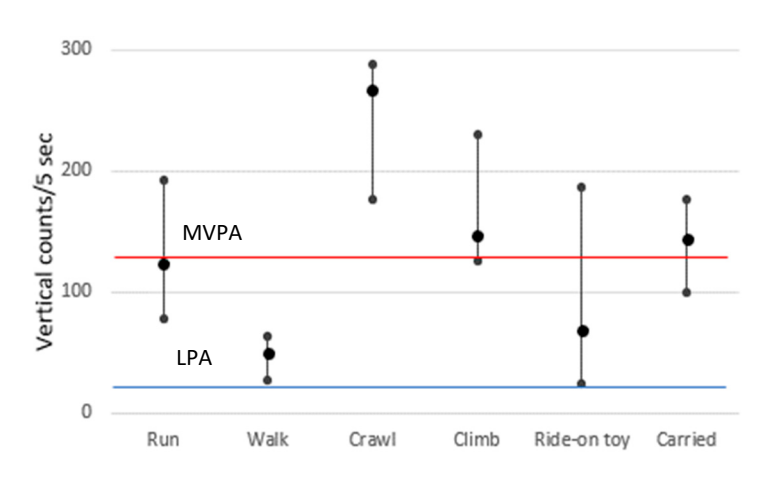
Figure 2. Median and Interquartile range of hip vertical accelerometer counts per 5 s (reproduction of the data published in Kwon et al.) [26]. * Note: The blue line indicates the lower threshold for LPA; the red line indicates the lower threshold for MVPA.

The current study found no difference in PA levels between weekdays and weekend days, which is consistent with a previous study among children aged 1 and 3 years [20]. Further, the current study found that day-by-day PA levels for three or four days were highly correlated. The data requirement of three valid days could be acceptable to achieve a reliable assessment of habitual PA among toddlers, as a previous study [27] indicated that 3-day PA data with daily monitor wear time \geq 9 h would achieve acceptable reliability (70%) in preschoolers aged 3 to 5 years. However, the current study was unable to test the reliability by the number of valid days required, because the maximum wear day period was only four days. Further investigation is needed to assess the volume of accelerometer data required for acceptable reliability among toddlers. The finding of a small variation in PA levels throughout the day, which is similar to the findings of a previous study [7], suggests a great potential to develop