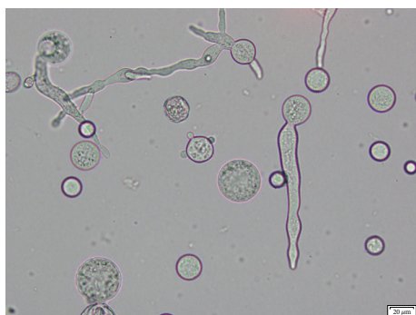
FIGURE 3: Mucor circinelloides yeast forms after cultivation of the isolate on Sabouraud dextrose agar incubated for 48 hrs under anaerobic conditions showing hyphae with single and multipolar buds (unstained, 200x)