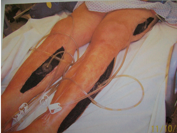
Figure 1 Compartment syndrome of both lower legs and both thighs secondary to Systemic Capillary Leak Syndrome (SCLS). Decompressive fasciotomy

mmol/L). Parameters of cholestasis and aminotransferases were not altered (bilirubin 0.7 mg/dL, alkaline phosphatase 66 U/L, gamma-glutamyl transferase 60 U/L, aspartate aminotransferase 32 U/L and alanine aminotransferase 39 U/L). Arterial blood-gas analysis showed the following: pH 7.06, pCO 2 43 mmHg, pO 2 91 mmHg, bicarbonate 11.9 mmol/L, anion gap 11.6 mmo/L. Creatine kinase was normal (124 U/L) on hospital day 1 and rose to over 7000 U/L on day 2 (day of admission to our ICU).