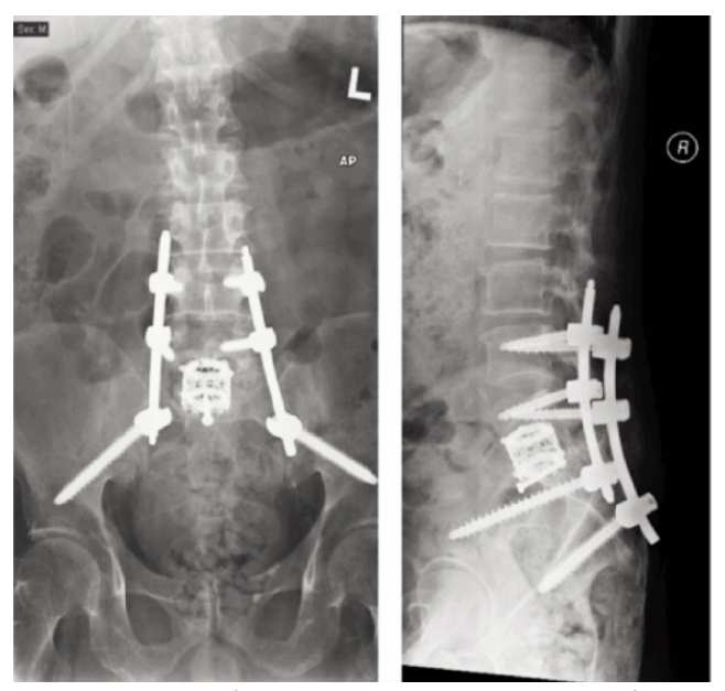
Fig. 3: Post-operative radiographs of anteriorposterior and lateral views of lumbo-sacral spine.