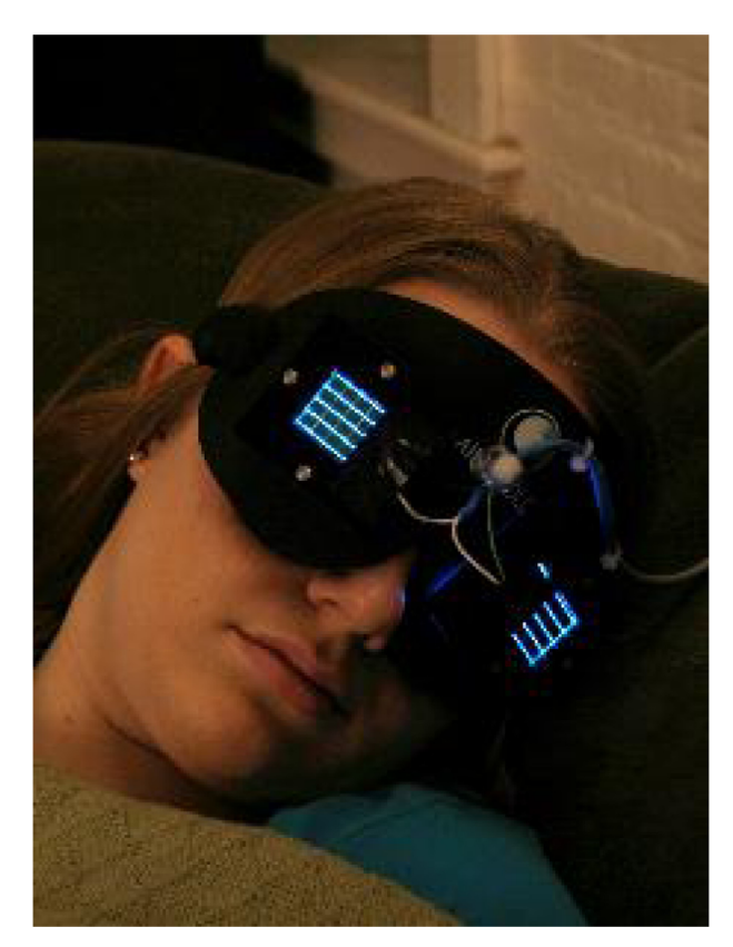
Figure 2 Flashing blue light mask used by older adults living at home. Notes: Flashing light was delivered through closed eyelids during sleep. The blue light mask shown here contains two blue LED arrays ( \lambda_{\max} =480 nm, FWHM =24 nm), one for each eyelid. In the study, the light-stimulus condition was a train of blue or red light pulses: 2-second duration light pulses spaced apart 30 seconds, for no more than 3 hours, delivered before predicted minimum core body temperature. 95 Abbreviations: LED, light emitting diode; FWHM, full width at half maximum.

Following the laboratory study, Figueiro<sup>87</sup> collected field data from 28 participants (nine early awakening insomniacs) in an 8-week, within-subjects study. Twice, participants collected data during 2 baseline weeks and 1 intervention week. During the intervention week, participants wore a flashing blue (active) or a flashing red (control) light mask during sleep (Figure 2). Light was expected to delay circadian phase. Saliva samples for DLMO were collected at the end of each baseline and intervention week. Wrist actigraphy and Daysimeter<sup>15,61</sup> data were collected during the entire study. Results showed that, compared to baseline, flashing blue light, but not flashing red light, significantly delayed DLMO (by approximately 34 minutes). Compared to day 1, sleep start times were significantly delayed (by approximately 46 minutes) at day 7 after the flashing blue light. More importantly, the light intervention did not affect sleep efficiency. Future work should investigate how effective a light mask can be at delivering phase advancing light to adolescents and DSPD patients while they are asleep. The challenge would be to determine the timing of CBT nadir, so that light can be applied at the correct portion of the PRC. A recommended