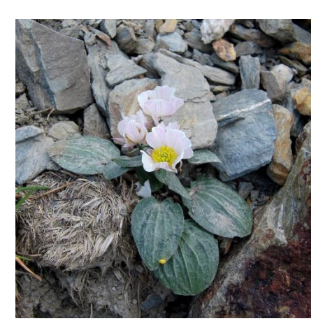
Figure 1. Ranunculus parnassifolius in its rocky high mountain habitat in the Catalan Pyrenees.

anti-cancer activity [38]. Altogether, this makes the species from the Ranunculaceae family reported here (and in particular R. parnassifolius ) good potential candidates for future phytochemical and pharmacological investigation.