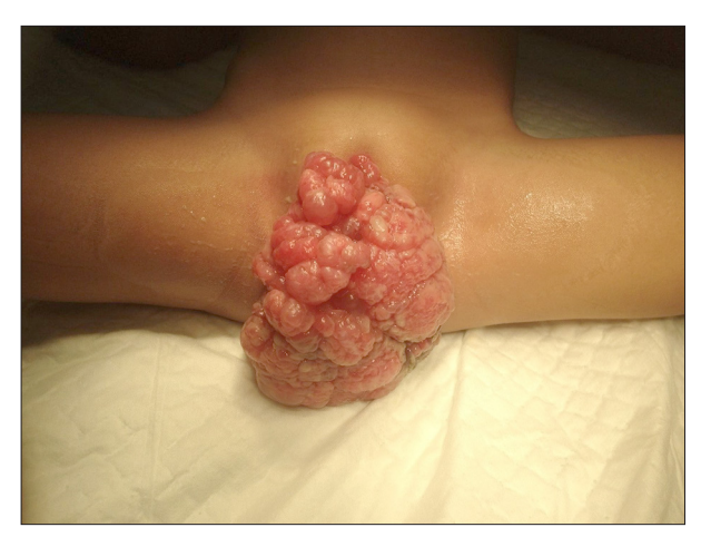
Figure 1. Protruding vaginal mass during the first visit.

Three months after the first surgery, the patient came back with recurrent vaginal mass. This time, the patient was covered by national health insurance. Gynecologic examination showed identical characteristics with the previous tumor at the same location, only smaller in size (6×5 cm) (Figure 2). A second chest x-ray was performed and revealed no metastases. In the second surgery, a wide excision with 2 cm of margin of healthy tissue was performed without intraoperative biopsy due to limited resources. Post-operative pathological examination showed malignant spindle mesenchymal tumor, suggesting a sarcoma botryoides finding. Further immunohistochemistry (IHC) examination revealed positive anti-desmin antibody at the tumor cell cytoplasm and positive anti-myogenin antibody at the tumor cell nuclei. Both stains also showed the typical sign of Nicholson cambium layer, supporting the diagnosis of ERMS (Figures 3, 4).