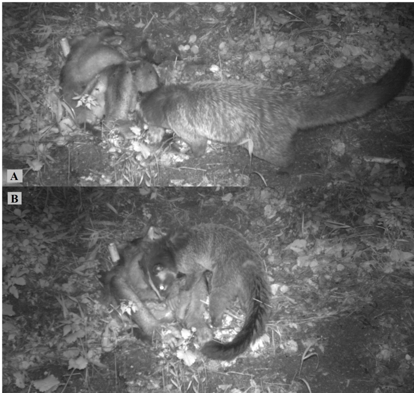
Figure 1. Masked civet consumed the intestines of a dead adult male golden snub-nosed monkey in Laohegou, (A) first time the carcass was detected and (B) consumption of the carcass (eating intestines).