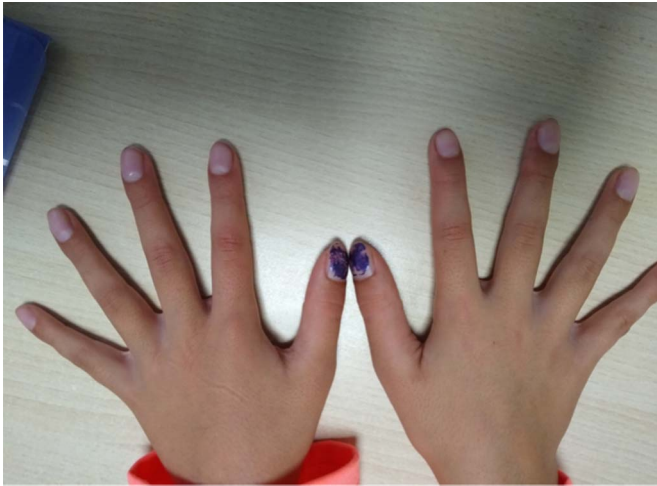
Figure 1. Image of the patient's hands showing clubbing.

treatment with sirolimus, laboratory test values were within normal ranges (Hb 14.1 g/dL, iron 43 \mu g/dL, and fecal calprotectin 22.7 \mu g/g).