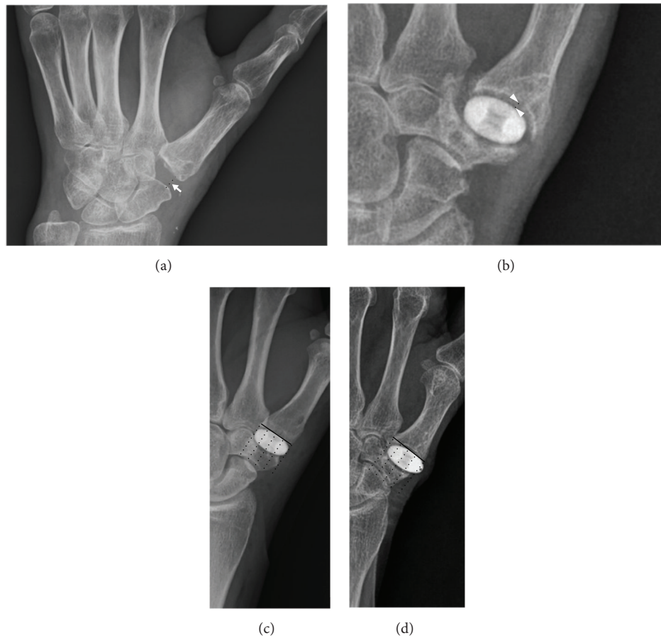
FIGURE 3: Postoperative radiographic measurements. (a) Proximal migration of the first metacarpal bone (arrow) was measured as the distance between the distal articular surface of the scaphoid and the proximal articular surface of the first metacarpal bone. (b) Radiolucency around the implant (arrowhead) was measured between the edge of the implant and the most distant rim of the surrounding metacarpal bone or trapezium. (c) Implant migration (*) was measured based on divided quarters of the trapeziometacarpal joint and classified as centered, one-fourth displaced, one-half displaced, or greater than one-half displaced.