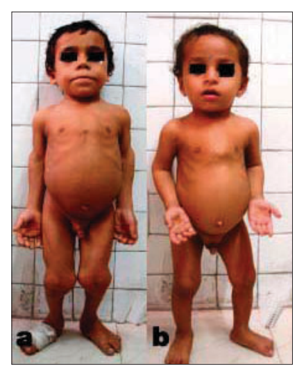
Figure 1: Clinical photograph of both male siblings (a- 8 year old, b- 2 year old) reveals rhizomelic shortening, genu valgum, exaggerated lordosis, and normal facies

The younger child was 83 cm tall (50th percentile of age is 84.10 cm) with a upper segment length of 50 cm (normal mean for age is 51.3 cm) and leg length of 33 cm (mean for age is 34 cm)<sup>4</sup> and an exaggerated lumbar