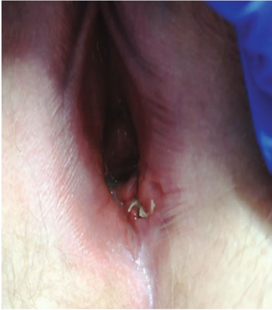
FIGURE 1: Ulcerated lesions located in the lower part of left labia minora in a context of atrophy with a pale pink hue (post biopsy).