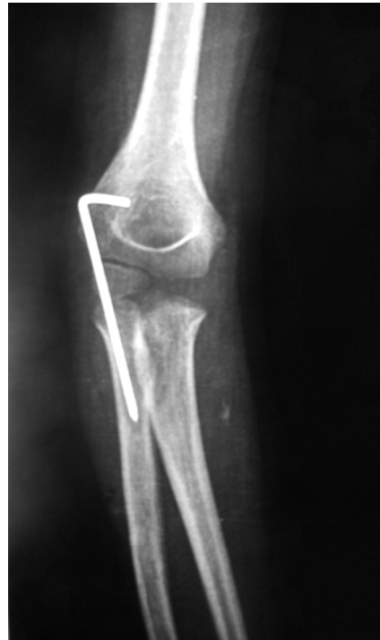
Fig. 4b: Post-operative Anteroposterior view radiograph.

reduction should be performed right away, as attempts at closed reduction will only serve to increase chondral damage or neural damage. As surgical repair of the dislocation is delayed, a more extensive surgical procedure is likely to be necessary to achieve a successful result.