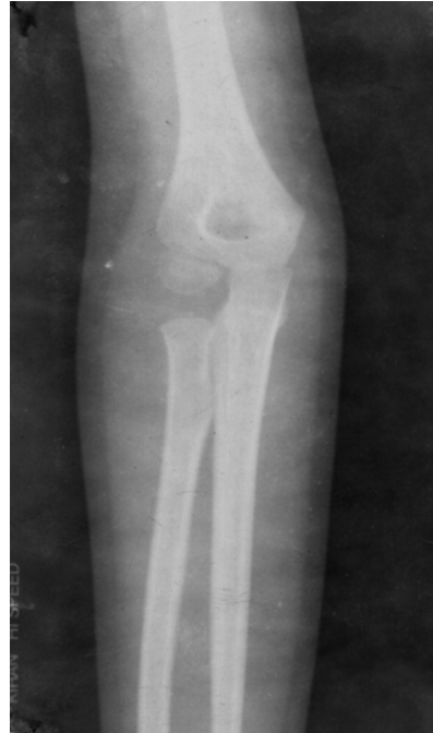
Fig. 1b: Anteroposterior radiograph of elbow.