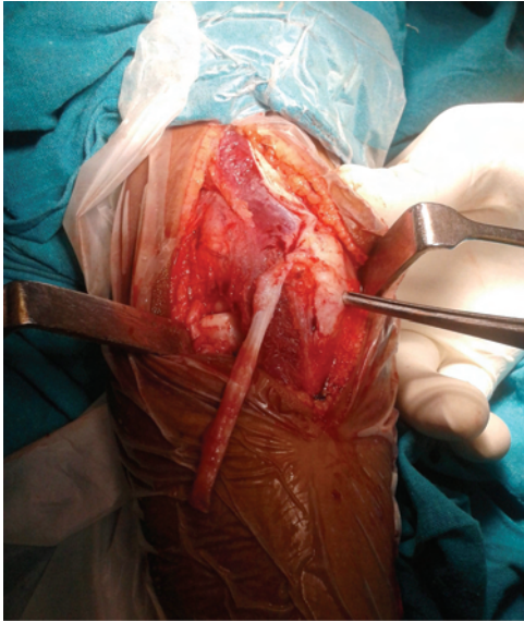
Fig. 3a: Intra-operative photo showing harvested lateral border of triceps aponeurosis.