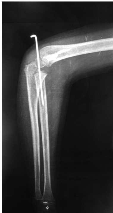
Fig. 4a: Post operative lateral radiograph.