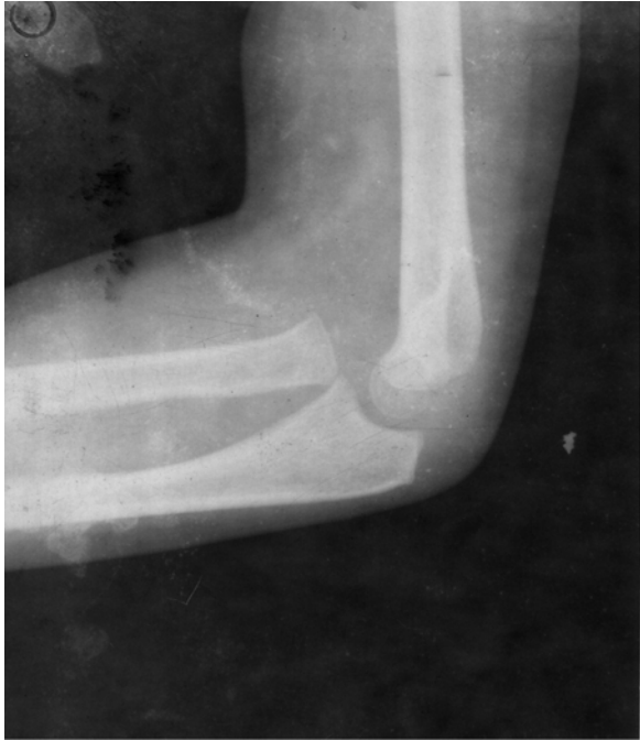
Fig. 1a: Lateral View radiograph elbow Showing anterior dislocation of radial head.