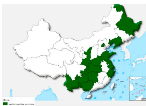
Figure A1. Sampling provinces of China Health Nutrition Survey (CHNS) in 2011.