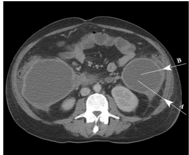
Fig. 3 Computed tomography image indicating the appropriate ( arrow A ) and incorrect ( arrow B ) direction for placement of the drainage catheter. Choosing the latter route may result in traversing the peritoneal recessus and leakage of the necrotic material into the peritoneal cavity

The left retroperitoneal route offers the optimal access to the pancreatic necrosis. In our opinion, the prerequisite for a safe retroperitoneal catheter drainage under sonographic guidance is extension of the peripancreatic collections at least down to the lower pole of the kidney. Moreover, this approach is ideally suited for subsequent minimally invasive pancreatic necrosectomy, should