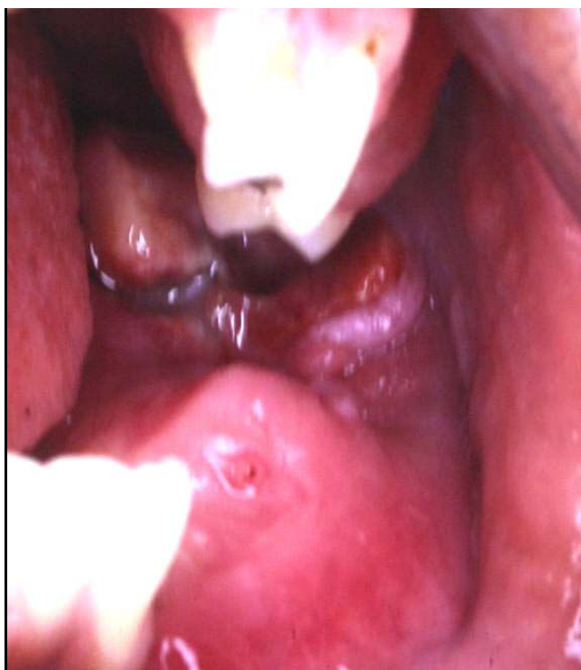
Figure 2 Clinical intraoral examination showing tissue proliferation which inverted the fundus of the buccal pouch from the region of tooth 33 to the retromolar triangle.

characterized by the presence of solid areas containing numerous oval, round, spindle-shaped or elongated irregular pleomorphic cells, intermingled with numerous irregular fragments of mineralized bone containing various cells and abundant osteoid tissue (Figure 4A).