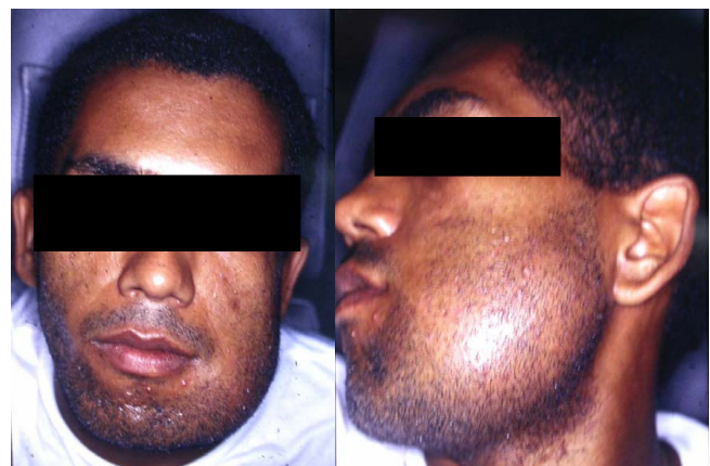
Figure 1 Extraoral examination showed a swelling causing deformity of the left mandibular body.

The anatomopathological exam was conclusive and the diagnosis was osteoblastic osteosarcoma. The tumor was