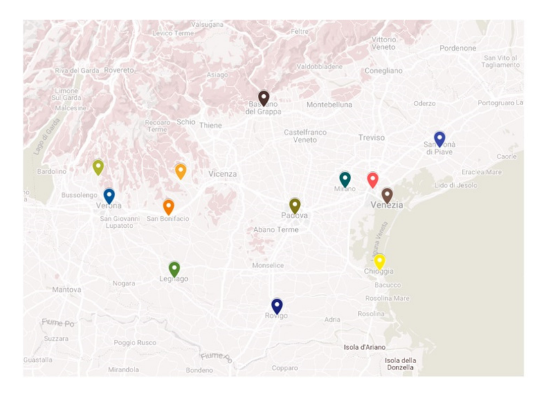
Figure 1. Location of enrolling centers.