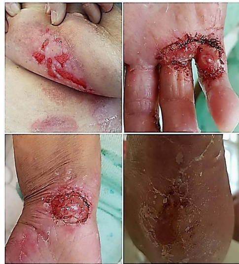
Figure 1. Submammary, palmo-plantar and radiocarpian ulcers on admission.

On admission we had an underweight patient (body mass index 18.3 kg/m 2 ), with a kyphoscoliotic thorax, with abolished vesicular murmur in the right lung base and with