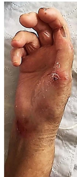
Figure 2. At 3-month follow up (epithelization of ulcers, improving xerosis, persistence of melanonychia).

slightly elevated blood pressure (160/80 mmHg). The laboratory investigations showed a hypochromic macrocytic anemia (Hb 9.6 g/dl, Ht 30, 11%), leukocytosis with neutrophilia (L 24.440/mm 3 , Ne 89.6%), mild thrombocytosis (Tr 484000/mm 3 ). The bacteriological exam of the ulcer identified a triple association of germs [ Pseudomonas aeruginosa , Enterobacter ESBL (+) and E. Coli ESBL (+)]. Chest radiography revealed a right basal pneumonia with pleural effusion.