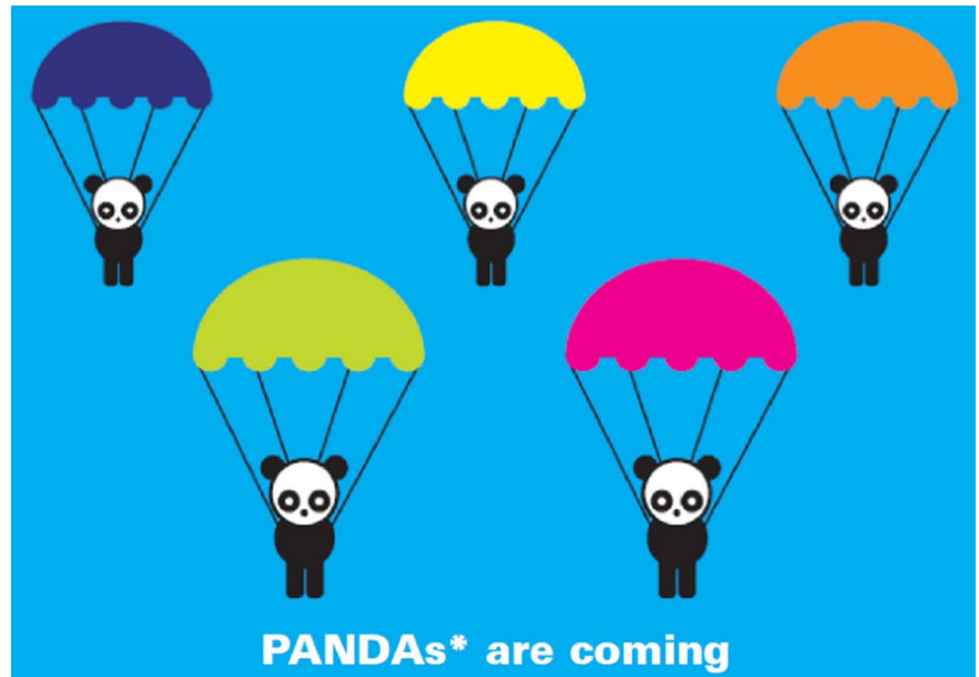
Figure 1 PANDAs postcard: an example of the viral marketing strategy to recruit practices.

consent to the study was obtained by the researchers. Practices were incentivised to take part in the trial, receiving a nominal payment to cover legitimate expenses.