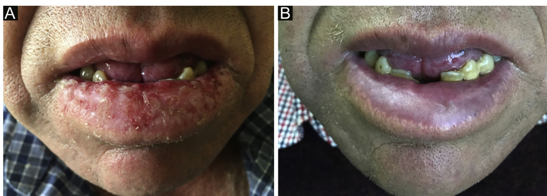
Figure 1 (A) The lower lip shows a diffuse xerotic erythematous plaque with erosions and hemorrhagic crusts. (B) Clinical improvement after 7-days of treatment with oral prednisone.

An otherwise healthy 52-year-old man, an agricultural worker, was referred to our hospital with a ten-year history of painful erythematous erosion on the lower lip. Physical examination revealed an erythematous plaque with diffuse desquamation along with erosions and crusts (Fig. 1A). Dermoscopy showed a well-defined lesion with the milky-red structureless area, small erosions, and multiple enlarged linear vessels on the periphery with a radial distribution. Scales although present on a small focus of the lesion was not a predominant feature (Fig. 2). Laboratory tests, including complete blood counts and tests for liver and renal function, showed normal findings, and hepatitis B and C and HIV infection was negative; PPD; chest X-Ray; thyroid