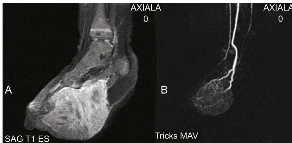
Figure 2 (A) MRI identifying an expansive mass with diffuse contrast enhancement. (B) MRA showing an expansive lesion supported by vascular structures. There is no evidence of arteriovenous fistulas or nidus.

João Renato Vianna Gontijo: Critical review of the manuscript; drafting and editing of the manuscript; approval of the final version of the manuscript.