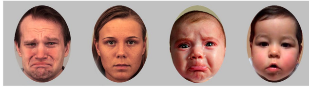
Figure 1. Examples of photographs used as stimuli, representing the four conditions of the study: adult crying and neutral faces (Id numbers BM17SAS and AF19NES from the KDEF database), infant crying and neutral faces (from our own database).

MRI acquisition. Brain images were acquired using a 3T GE Sigma Excite MRI scanner at the University Hospital's Magnetic Resonance Service for Biomedical Research. The fMRI scan consisted of 287 echoplanar images (T2*-weighted gradient-echo pulse sequence: FOV = 240 mm; TE = 22 ms; TR = 1800 ms; FA = 90°; 33 slices; thickness = 3.5 mm; DF = no gaps; voxel size = 3,75 × 3,75 × 3,5. A T1 anatomical image was also recorded: FOV = 240 mm; TE = 1.736 ms, TR = 8.716 ms, 196 slices, thickness = 1 mm, matrix = 256 × 256 mm 2 ).