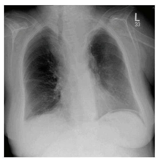
FIGURE 1: Upright chest plain radiograph (X-ray) showing free air (gas) under diaphragm.

Pyometra primarily results from obstruction of cervical canal which in turn interferes with its natural drainage and increases susceptibility to infections leading to accumulation of pus and bloody material [1]. Possible etiologies are many and include benign or malignant gynecologic neoplasms, cervical stenosis, atrophic cervicitis, senile cervicitis, gynecology related postoperative complications, postradiation therapy, congenital malformations (anomalies), uterine infections, age-related endometritis, puerperal endometritis with retention of lochia, use of intrauterine device (IUD), and others [1, 5, 6]. The incidence of concomitant gynecologic malignancy as an underlying etiology for pyometra is considerably high [4], particularly in elderly postmenopausal women [7].