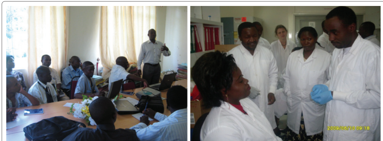
Figure 3. Two week Makerere University, Uganda training for thirty six laboratory scientists from throughout Sub-Saharan Africa.

network partners actively investigated eighteen different outbreaks on U.S. military installations and among defined high-risk groups [17]. These high-risk groups were defined as deployed or deploying personnel, shipboard personnel, new accessions (basic and advanced military trainees and service academy students), health care workers, children and staff in daycare centers and pregnant women. Stressful military environments, highly-mobile missions and complex troop dynamics have proven in the past to help to propagate pandemics and have drawn the attention of the military's operational leadership and leaders of civilian sectors within host countries [18]. These investigations involved anywhere from a few dozen cases to situations where greater than one thousand cases were tested at a given time.