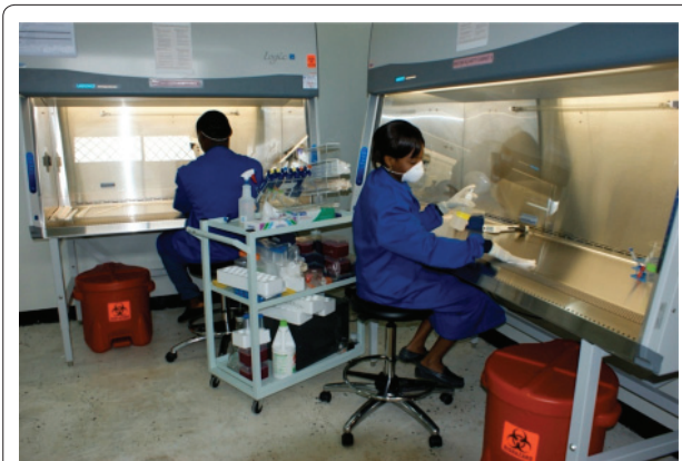
Figure 2. Newly Commissioned Biosafety Level-2 Laboratory at the University of Buea, Cameroon.

Rapid identification of outbreaks and support of timely response efforts are key components of complying with IHR(2005), and are core focus areas of the AFHSC-GEIS network [5,15]. These efforts are provided in response to host country requests for assistance with new or ongoing outbreaks and consists of a wide range of functional support. These support efforts include field team support, epidemiology or consultative support and/or laboratory diagnostic support. These collaborative exchanges strengthen relationships, build and maintain trust and are a critical component of the long-standing relationships built between the network partners and their sponsor host countries. Several of the partnerships between the U.S. and host country militaries (mil-mil partnerships) that have developed over many years have served to empower the host country military's role in supporting outbreak response activities within their own