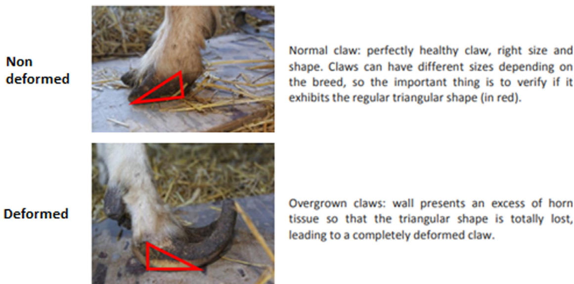
Fig. 2. Scoring method for non-deformed and deformed claws. Claws with a rotation of either or both the medial or the lateral claw wall(s), leading to a change of the weight bearing surface from the sole to the wall were also classified as deformed.