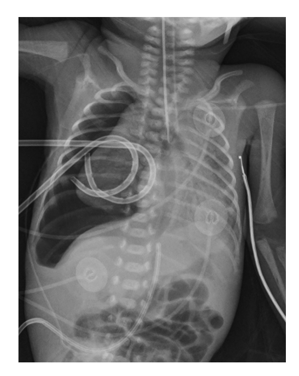
Figure 1. X-ray on the first day of life. Tension right-sided pneumothorax with the leftward shift of the mediastinum after surfactant administration.

Stabilization proved difficult with a consistently high flow through the bronchopleural fistula requiring the application of two suction drains at -10 \text{ cmH}_2\text{O} . Simultaneously, mechanical ventilation was started (PIP 25, MAP 10, FiO<sub>2</sub> 0.4) and the infant was positioned in right lateral decubitus.