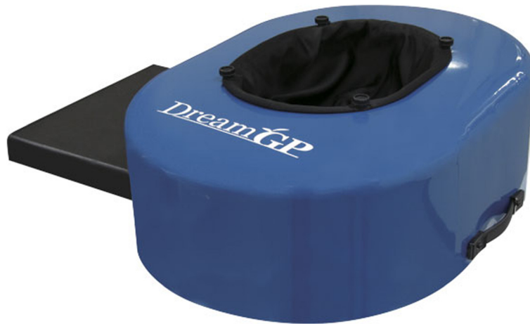
Fig. 1 3D foot scanner, Footstep PRO by Dream GP Company, Osaka, Japan

easily reach without needing to raise or lower their arms too much. The participants looked straight ahead and stood as still as possible.