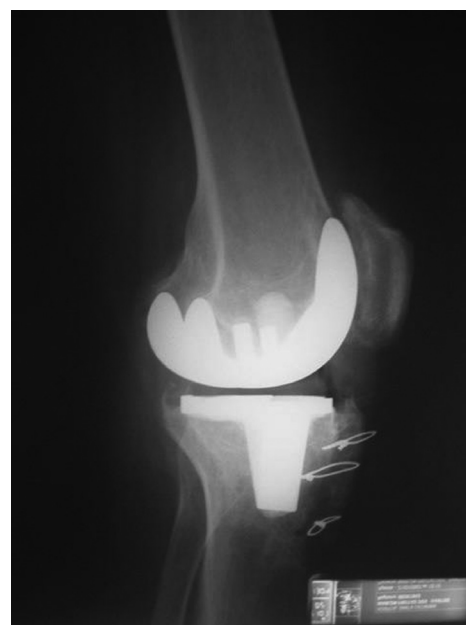
Figure 3 - Total arthroplasty without posterior stabilization and without replacement of the patella, after six years of clinical course