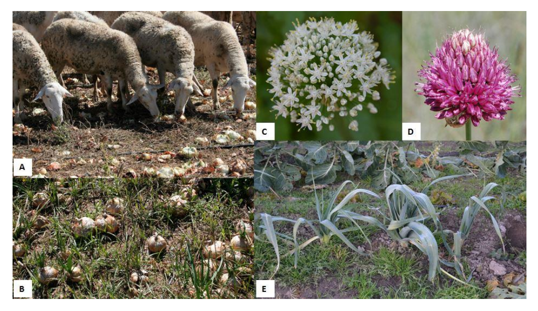
Figure 2. ( A ) A sheep herd grazing on an onion ( Allium cepa ) field. ( B ) Onion ( A. cepa ) field ready to harvest. ( C ) Characteristic umbel of white flowers of an onion ( A. cepa ). ( D ) Umbel of pink flowers of a round-headed leek ( A. sphaerocephalon ). ( E ) Leeks ( A. ameloprasum var. porrum ).

The genus Allium , included in the family Amarylliaceae , comprises a large number of species. Four of these species are well known by most people since they are food widely used in human nutrition: onion ( Allium cepa ), garlic ( A. sativum ), leek ( A. ameloprasum var. porrum ) and chive ( A. schoenoprasum ). Nevertheless, there are also many other wild varieties such as three-cornered leek ( A. triquetrum ), wild garlic or crow garlic ( A. vineale ), round-headed leek ( A. sphaerocephalon ), ramsons or bear's garlic ( A. ursinum ), rosy garlic ( A. roseum ) and pale garlic ( A. paniculatum ), that are commonly found in the Mediterranean area [12,72] (Figure 2).