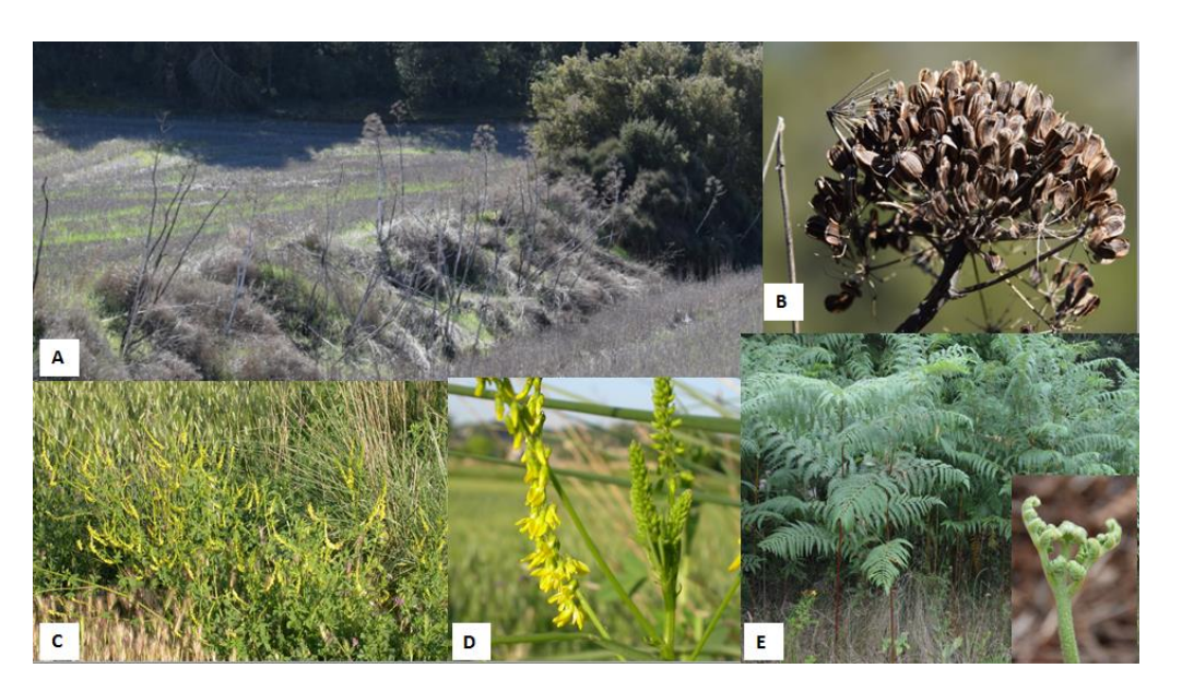
Figure 1. Some examples of plants associated with haemorraghic disorders. (A) Giant fennel ( Ferulla communis ) on an embankment. (B) General aspect of fruits of giant fennel. (C) Sweet clover ( Melilotus officinalis ) grown on the edge of a wheat field. (D) Flower of M. officinalis . (E) General aspect and fronds of bracken fern ( Pteridium aquilinum ). The small picture shows a "fiddlehead" sprouting.

In addition, another important plant, the bracken fern ( Pteridium aquilinum ), must also be included in this group. The haemorrhagic disorder caused by bracken fern is not mediated by coumarins. In this case, the anaemia is due to platelet depletion [12].