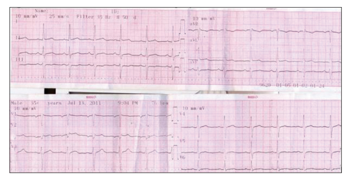
Figure 2: Normal sinus rhythm electrocardiography with no ST segment depression was observed