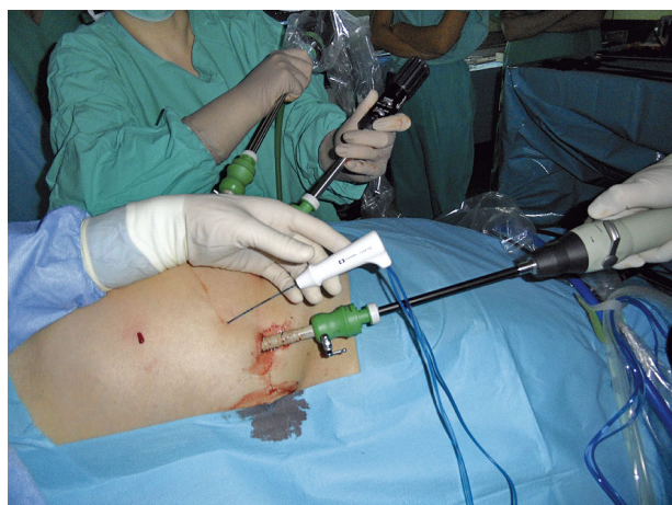
Fig. 1. Operating room setting and intraoperative field during laparoscopic RFA procedure

In all of the four patients the procedure was carried out without any difficulties and the described lesions were located within the liver. In three of the patients all the lesions underwent thermoablation from a single puncture. It turned out that in patient no. 4, who had a single tumour in segment 4b, the lesion was larger than the one described in CT. Its diameter was 45 mm and it comprised the falciform ligament of the liver on one side and the wall of the gallbladder on the other side. First the patient underwent laparoscopic resections of a fragment of the falciform ligament and gallbladder. Thermoablation of the lesion was carried out from three separate punctures. Patient no. 1 had another lesion