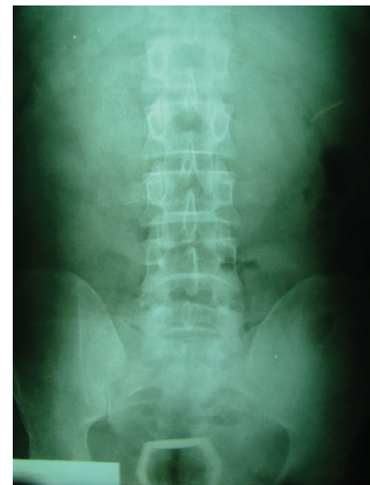
FIGURE 3: X-rays visualized a glass leading obstruction.

A middle-aged man was referred to the ED with severe anal pain and bowel obstruction. In medical history he described to use glass as a sex toy. He failed to extract it himself. Digital rectal examination revealed the RFB in 5 to 6 cm distance