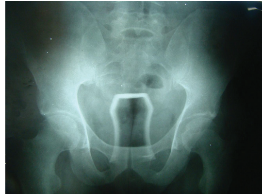
FIGURE 2: X-rays showed a glass inserted in the rectum.

noticed anal bleeding (Figure 2). He was administered broad spectrum antibiotics and tetanus prophylaxis. Anorectal examination revealed lacerations around anal mucosa with internal sphincter injury. The patient was taken to the OR and the glass was extracted manually under GA. The patient was discharged without sequelae in 24 hours.