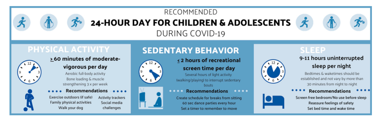
Figure 3. The 24-h movement behavior recommendations during the COVID-19 pandemic.