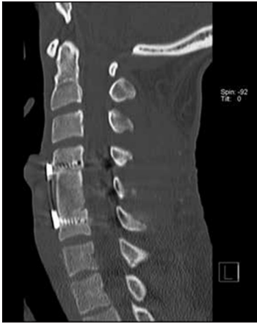
Figure 5: Postoperative sagittal T2-weighted magnetic resonance imaging of C5 burst fracture

Our patient was likely spared from a complete spinal cord injury because of the bilateral lamina fracture and wide coronal split and dislocation [Figure 2] that partially decompressed the spinal canal. The etiology of the unilateral spinal cord injury is best seen on the axial MRI [Figure 6] that demonstrates the fracture edge of the posterior aspect of the vertebral body driven into the left side of the spinal cord. While CT and plain radiographs play an important role in the initial management of spine-injured patients, MRI is considered superior in detecting the extent of spinal cord injury, spinal alignment, damage of the intervertebral discs, and involvement of the surrounding soft tissue. [3] Signal cord hyperintensity was noted on T2-weighted sagittal MRI suggestive of a contusion at the C4–C5 level [Figure 4].