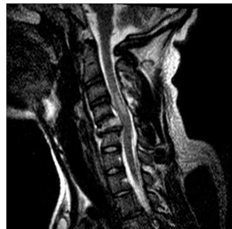
Figure 4: Preoperative sagittal T2-weighted magnetic resonance imaging of C5 burst fracture