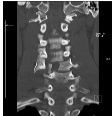
Figure 2: Preoperative coronal computed tomography of C5 burst fracture