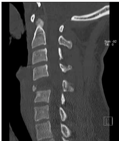
Figure 3: Preoperative sagittal computed tomography of C5 burst fracture